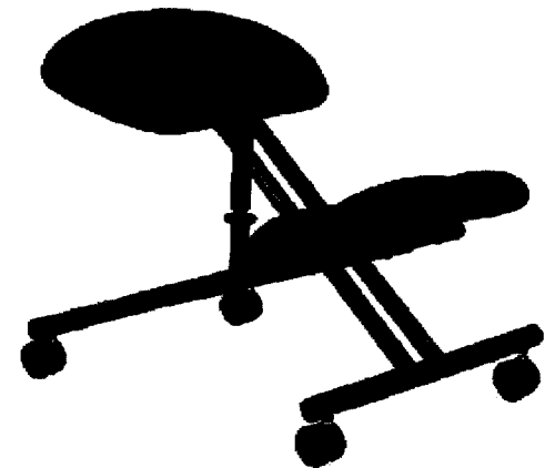
2143 Kneeling Chair - Shown in Renewal (RN45, Grade 4)

Dimensions: 18 1/2w x 25 1/2d x 23h - LB: 18 - FT 3 : 2.8